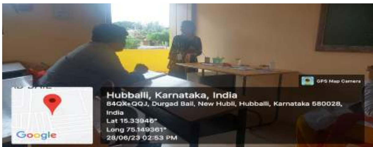
COOKING WITHOUT FIRE COMPETITION